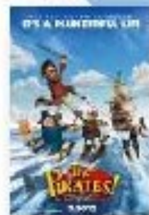
The Pirates! Band of Misfits Saturday, April 14th

(Seating is Limited: First-Come, First-Served Basis)