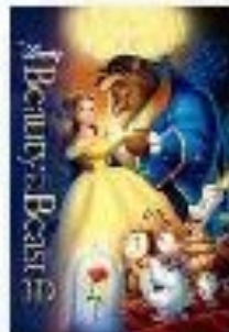
Beauty and the Beast Saturday, February 11th