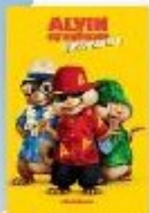
Alvin & the Chipmunks Chipwrecked Saturday, January 14th

2nd Saturday of the Month January - April